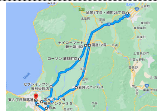
Total distance 2,146km